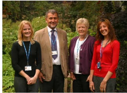
Campaign Team North Bristol NHS Trust