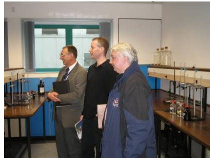
Laboratory walkabout by Champions – University of Edinburgh