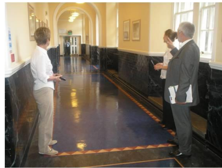
Champions on a walkabout – University of Edinburgh